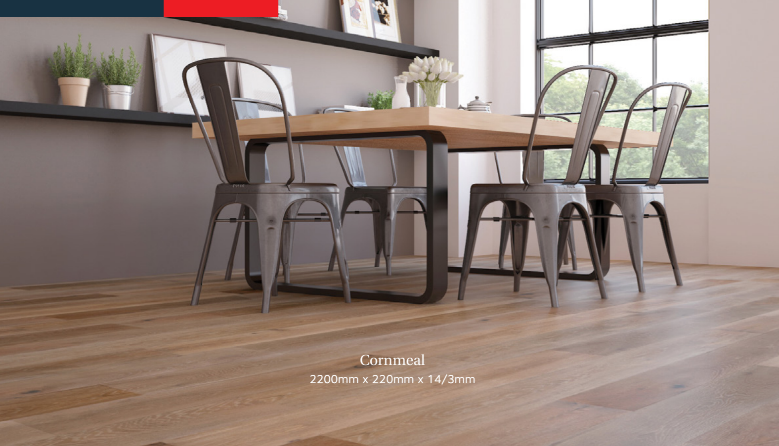
Cornmeal 2200mm x 220mm x 14/3mm