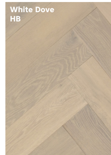
White Dove HB