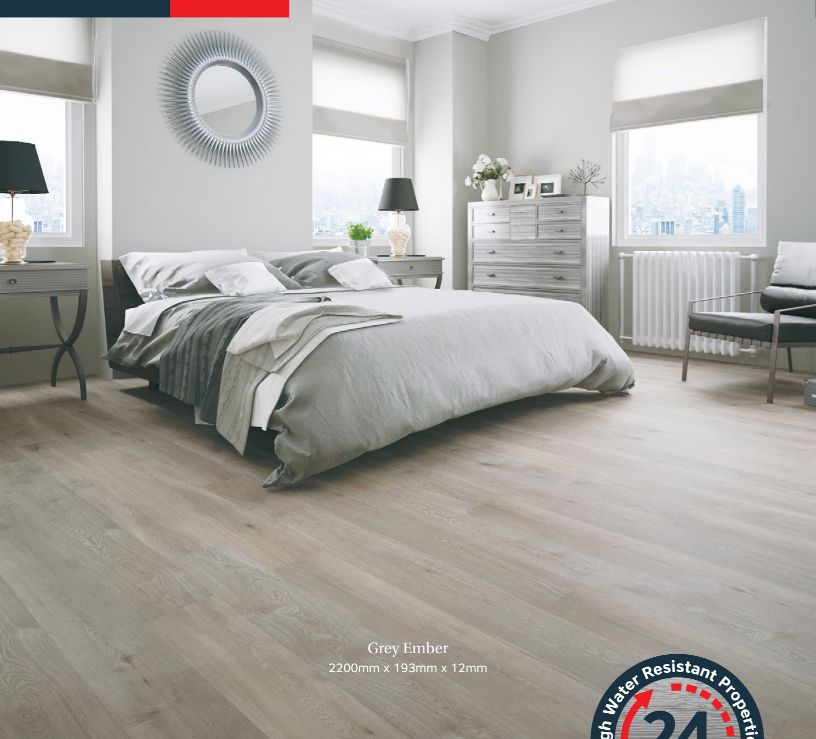
Grey Ember 2200mm x 193mm x 12mm