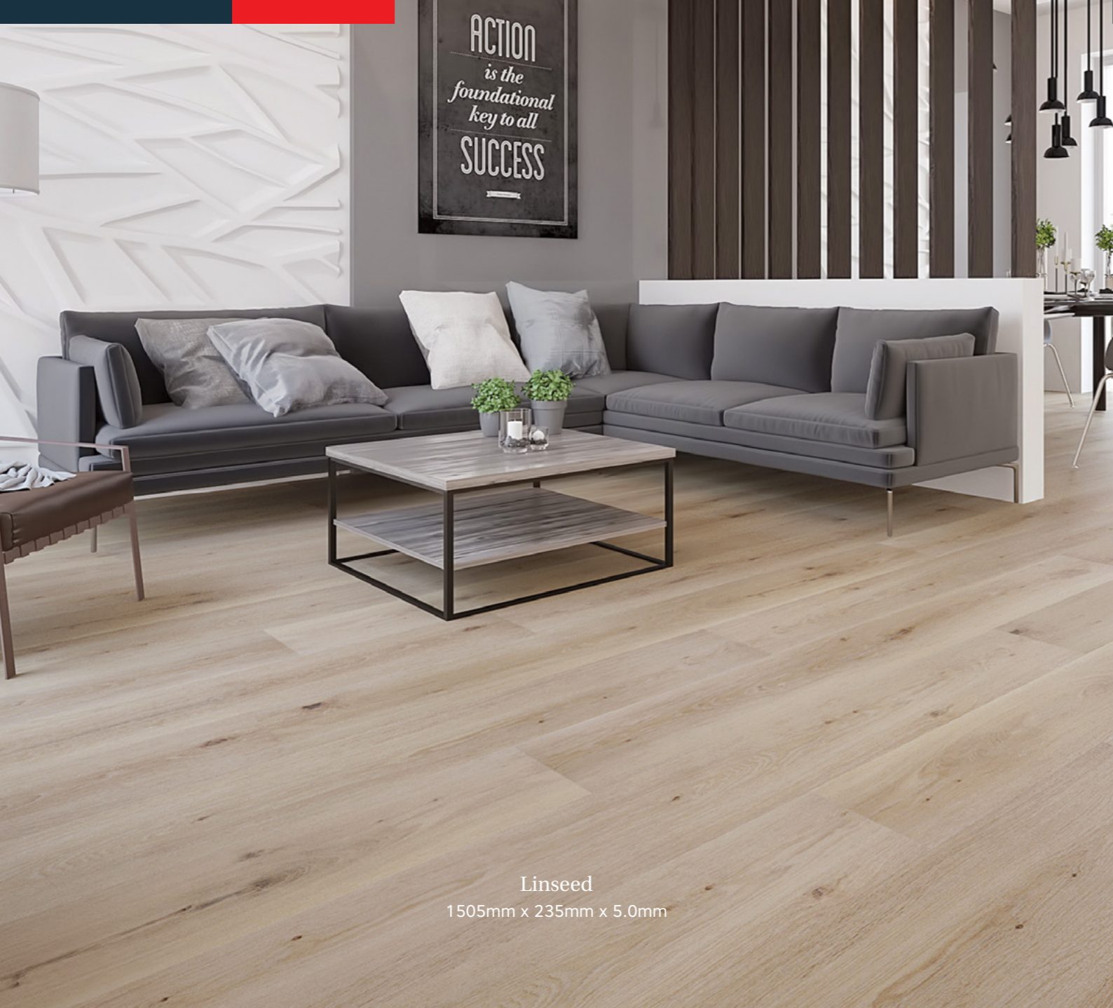
Linseed 1505mm x 235mm x 5.0mm