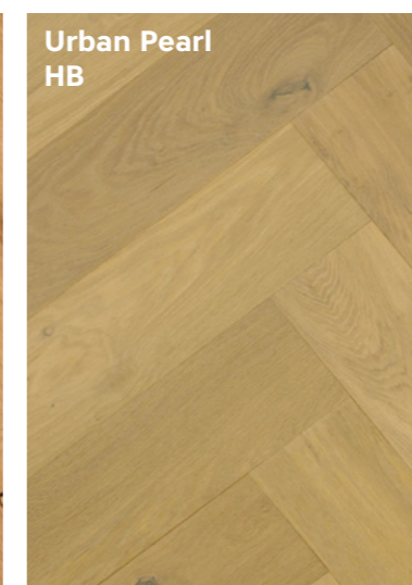
Urban Pearl HB