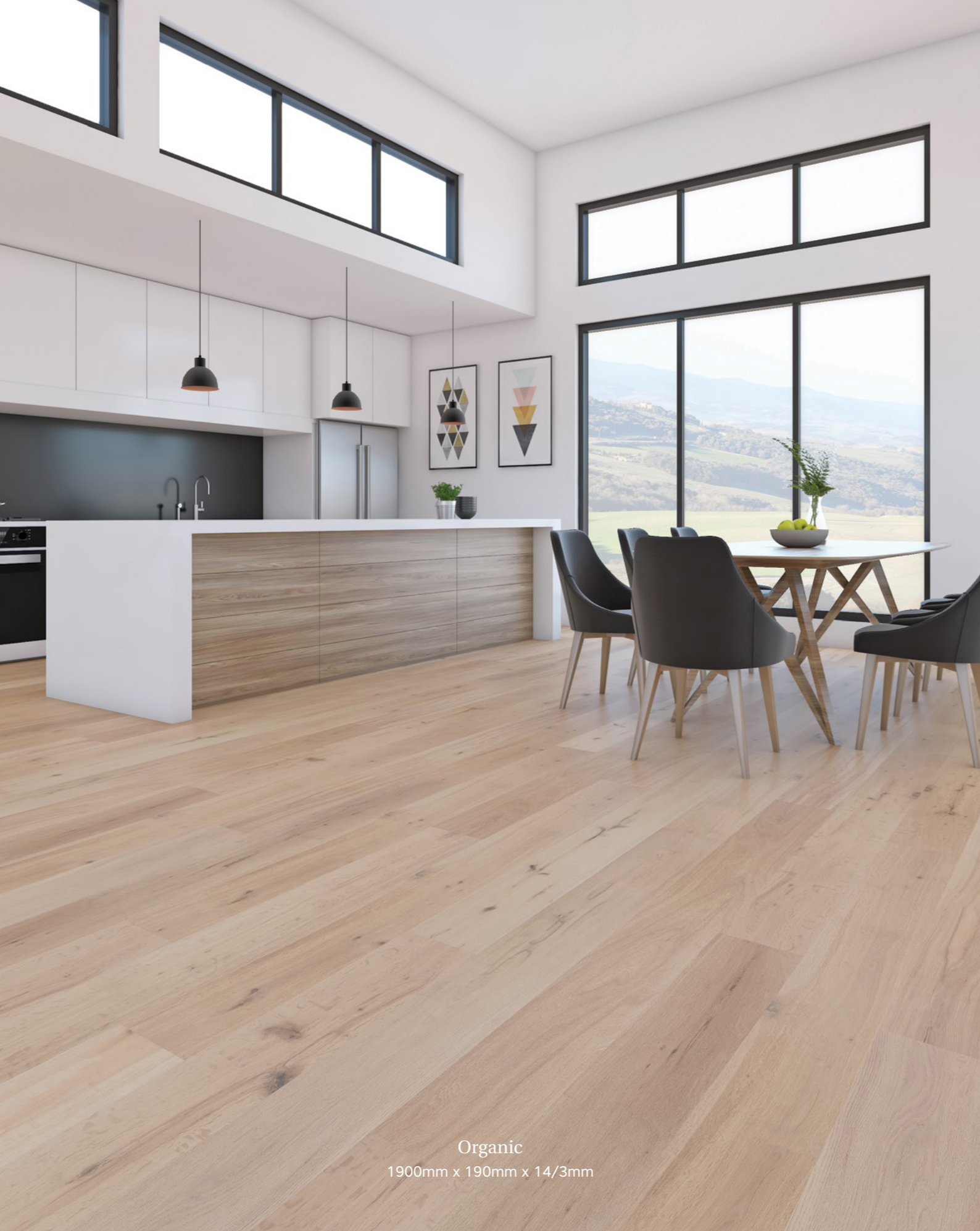
Organic 1900mm x 190mm x 14/3mm