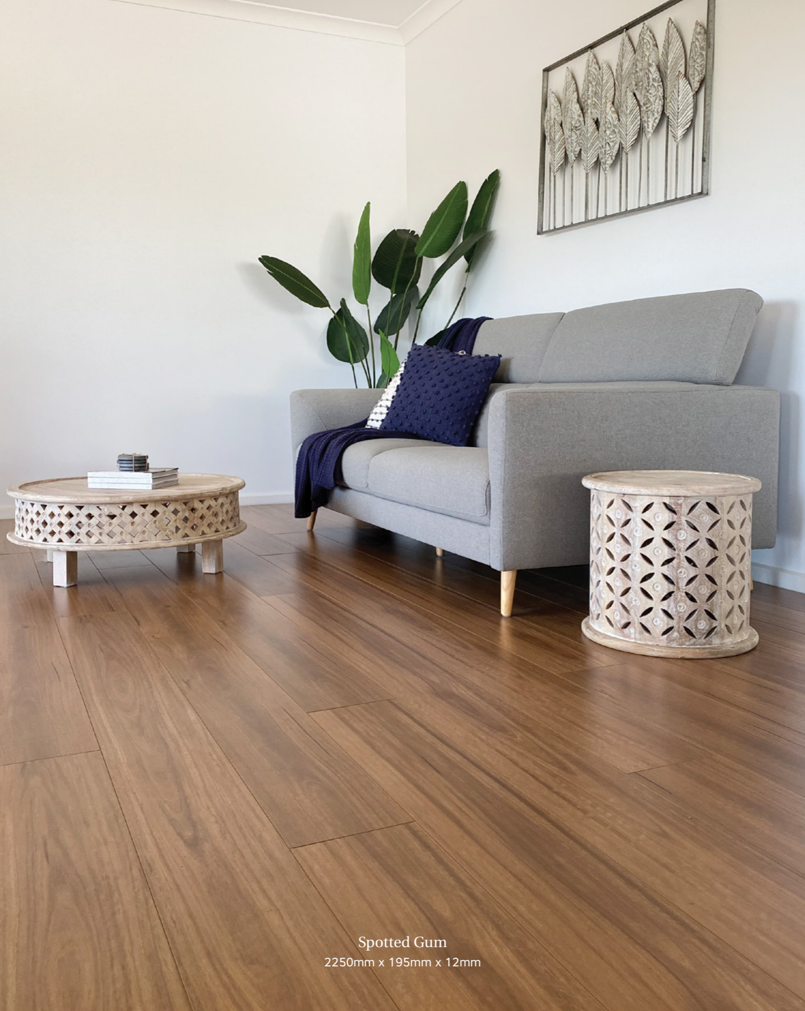
Spotted Gum 2250mm x 195mm x 12mm