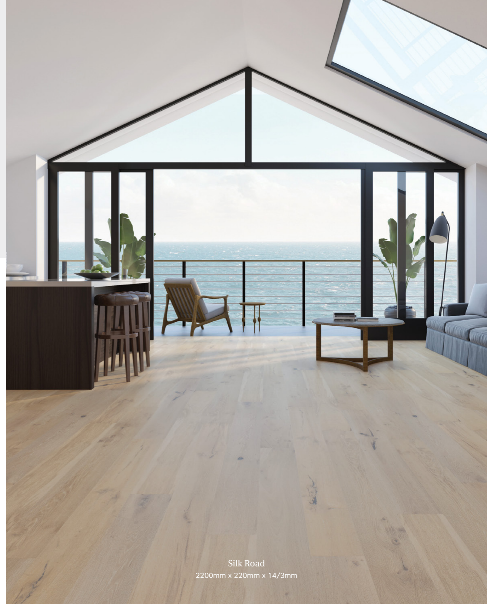
Silk Road 2200mm x 220mm x 14/3mm